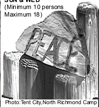
Photo: Tent City, North Richmond Camp

General Adm. $12 Richmond Res./Srs/Stu $6 Families Pay What You Can Native Americans/Tent City Participants $FREE