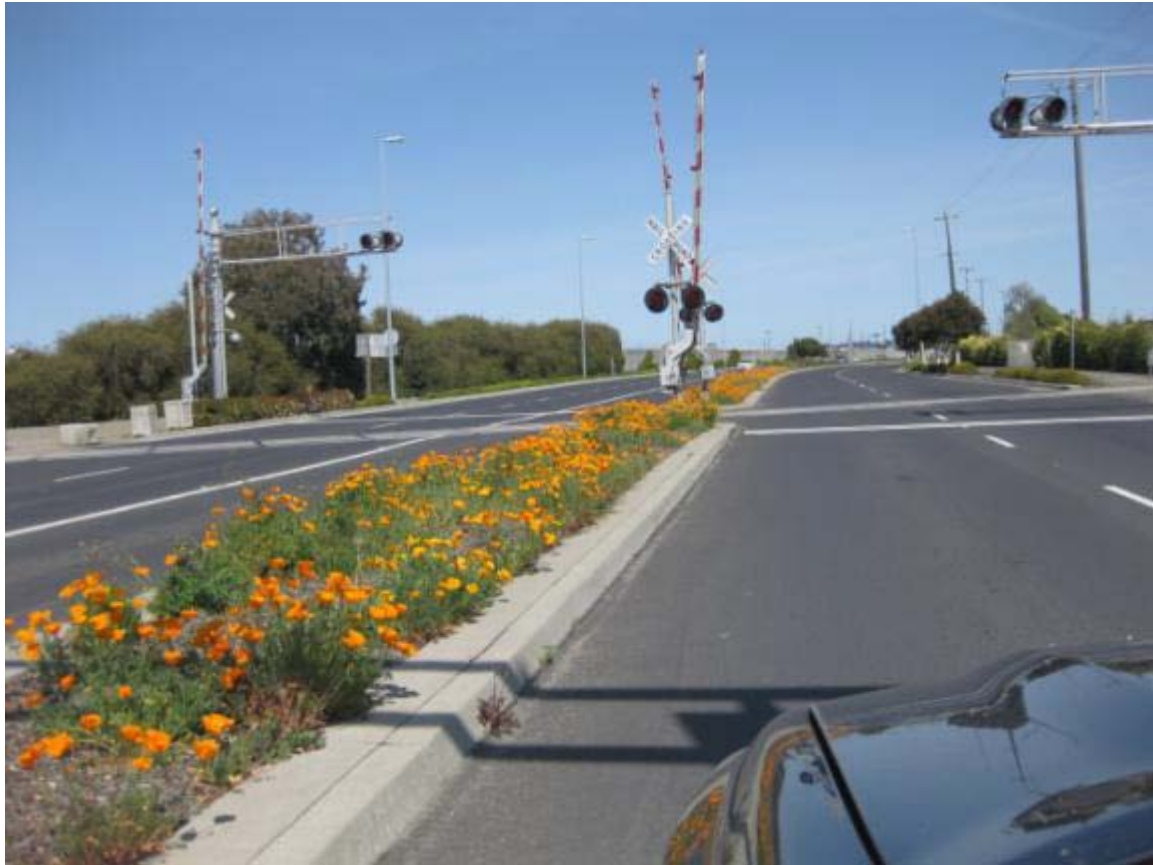
Wildflowers in the Richmond Parkway median added a lot of class