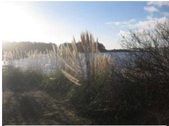
Pampas grass at the Chevron Refinery

Richmond's Code Enforcement unit works hard, but there are just some things they cannot or will not deal with. These include violations by Chevron and the railroads. I don't know whether it is fear of these corporate giants, intimidation, professional courtesy, or what, but while ordinary property owners get busted every day for weeds, trash and other nuisances, Chevron and the railroads get a free pass. At one time, Richmond was recognized as a pioneer for incorporating control of invasive exotic plants into its weed abatement ordinance, but Code Enforcement and the city attorney are loath to implement when Chevron or a railroad is the violator. The Chevron refinery is host to acres of such plants, including French broom, fennel and Pampas grass. Pampas grass is one of the most harmful invasive exotic plants in California. It is listed in the Food and Agriculture Code as a noxious weed and is defined as a public nuisance by the California Invasive Plant Council . Each plume produces up to 100,000 seeds that are widely dispersed by wind and develop without fertilization." The railroad rights of way through Richmond are targets for graffiti dumping and weeds, but nothing is done about it. The land over the BNSF tunnel in Point Richmond is overgrown with brush, including banned invasive exotics, but Code Enforcement ignores it despite years of complaints.