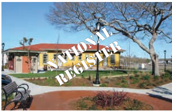
✓ Santa Fe Reading Room – Saved!