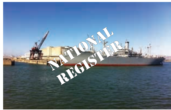
✓ Riggers Loft – Saved!