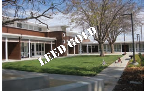
✓ Maritime Child Care Center – Saved!