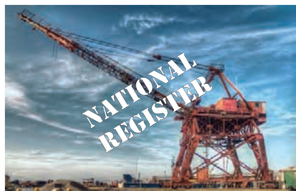
✓ Whirley Crane – Saved!