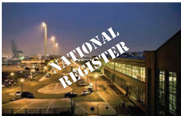
✓ Ford Plant & Craneway – Saved!