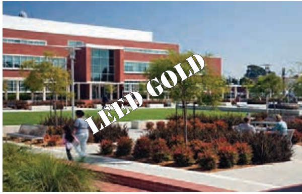
✓ Civic Center – Saved!