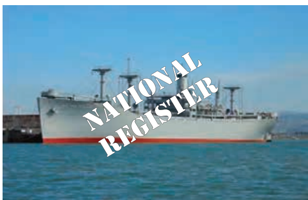
✓ SS Red Oak Victory– Saved!