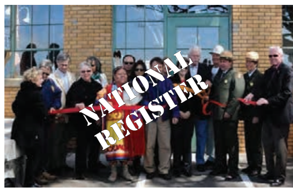
✓ Rosie Visitor Center– Saved!