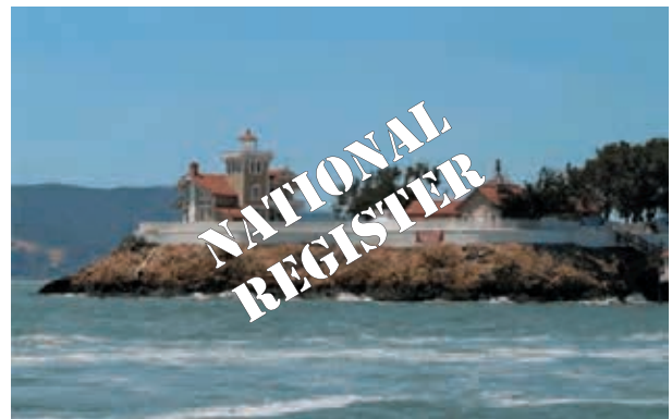
✓ East Brother Lighthouse– Saved!