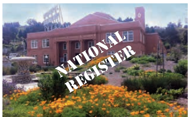
✓ The Richmond Plunge – Saved!